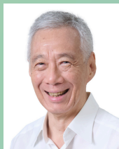
Member Lee Hsien Loong